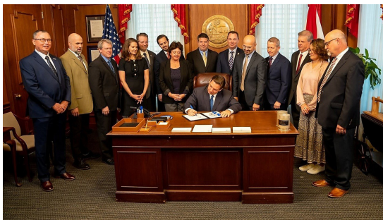
Governor Ron DeSantis signs historic legislation

At the Daytona Regional Chamber, advocacy is a cornerstone of the organization. The organization is politically non-partisan, and the work of the Chamber does not shy away from supporting the cause of the Greater Daytona Beach area business community. The Chamber remains constantly prepared to side with business and commerce by providing the resources necessary for success.